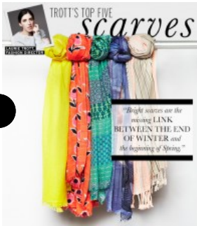
Trott's Top 5 Five Chic Scarves To Take Your Wardrobe From