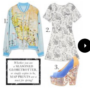
Shopping The Must-Have Print You Need In Your Wardrobe