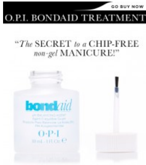
Go Buy Now The Trick to Longer-Lasting Nail Polish